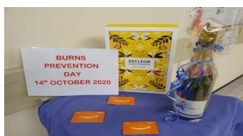
Some examples of Alder Hey's tweets: